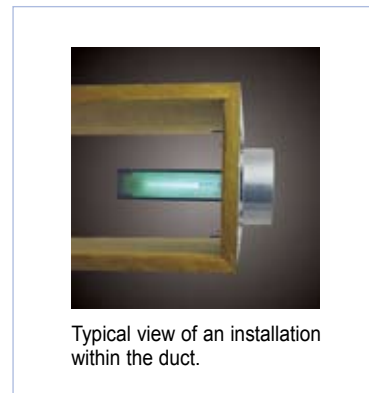
Typical view of an installation within the duct.

activTek INDUCT 2000 can be installed in any HVAC system directly into the plenum or directly above the air handler in remote or “down stream” locations.